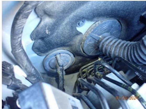
Fig 6. Dirt/grease on engine bay tubing