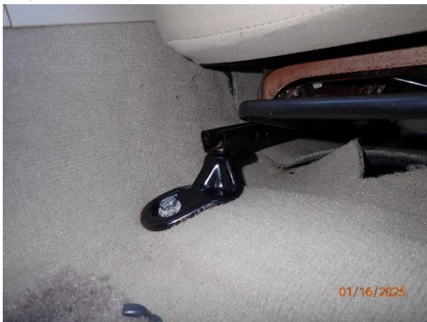
Fig 5. Carpet/seat rails clean