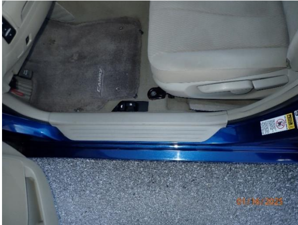
Fig 3. Door jambs clean