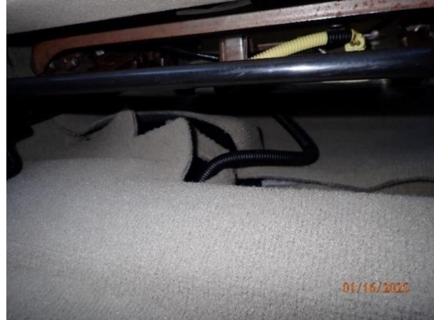
Fig 4. Carpet/seat rails clean