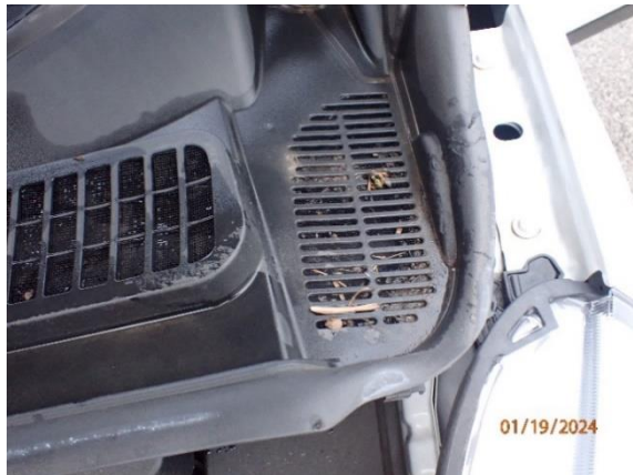
Fig 5. Dirt/debris in vent in engine bay