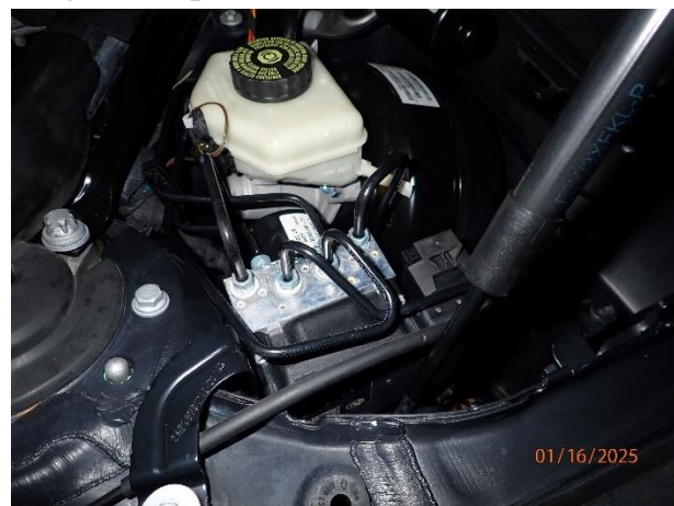
Fig 6. Engine bay free of dirt/grease/ debris