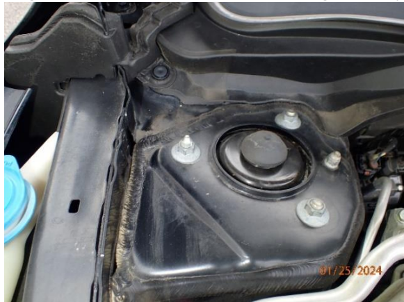
Fig 7. Dirt on engine bay strut mount