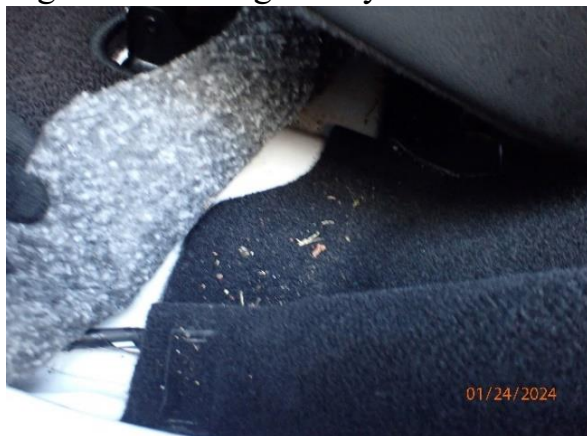
Fig 9. Dirt/debris under carpet mats