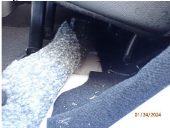
Fig 3. Debris on/in between carpet