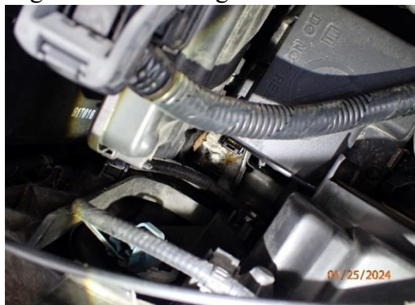
Fig 10. Dirt/leaves inside engine bay