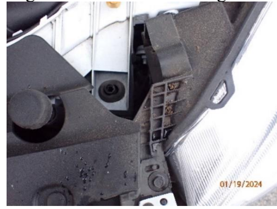
Fig 4. Dirt/debris near hood latch area