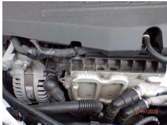
Fig 2. Dirt around/under engine cover