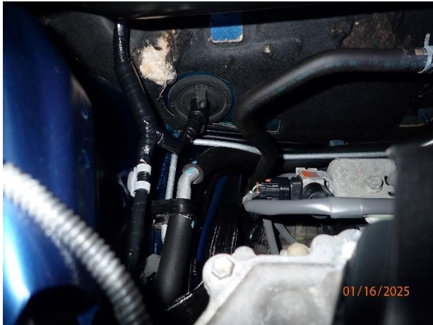
Fig 1. Engine tubing free of dirt/grease