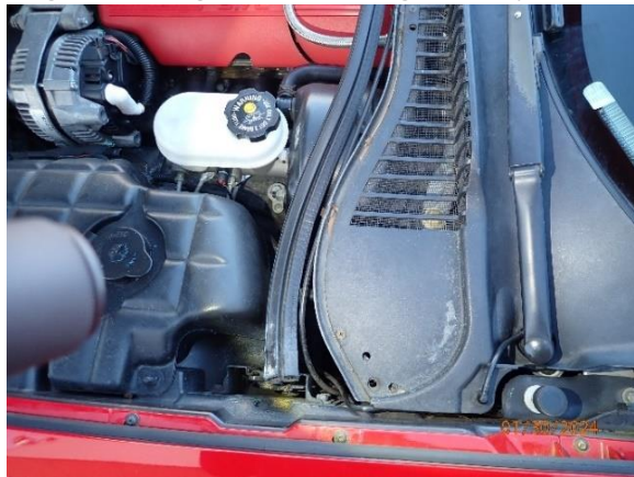
Fig 8. Dirt under engine hood rain seal