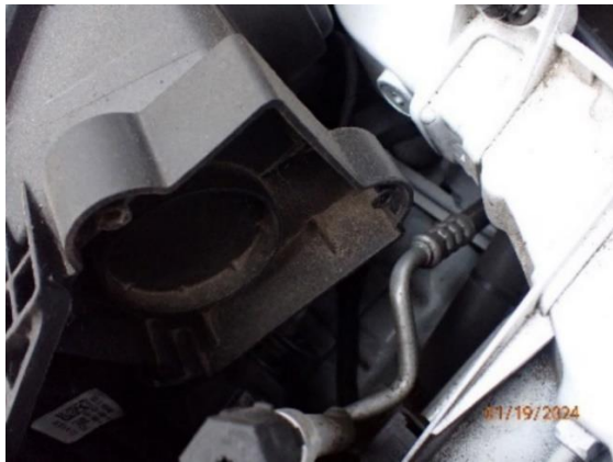
Fig 1. Dirt in air intake